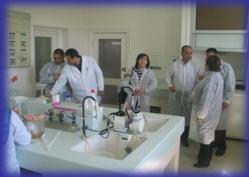
Practical exercise in the physico-chemical lab