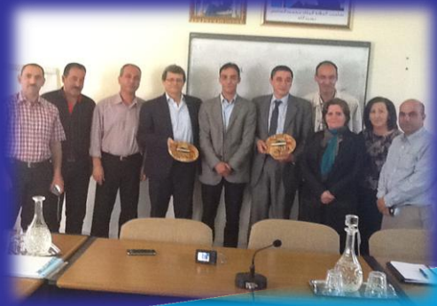
Meetings and discussions